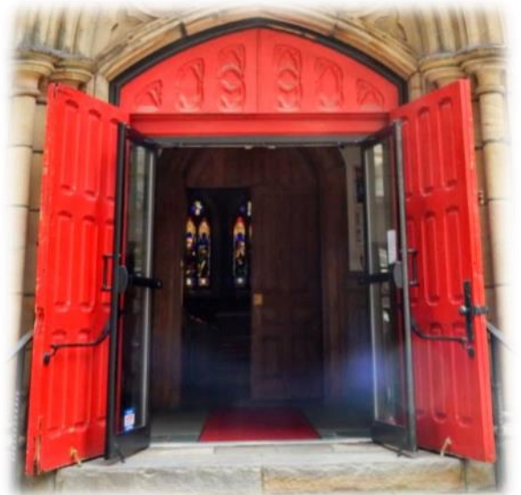
Trinity Episcopal Cathedral in Pittsburgh, PA

Many people come to the Episcopal Church from other traditions, and some have had bad church experiences that have left them scarred or leery about God and God's people. We know that churches are not clubs for saints but hospitals for sinners. So just as hospitals display a red cross, we also like to announce that we are a place of healing and restoration. At our best, our parishes help the wounded put their lives back together, provide comfort in time of need, and the doors open wide to welcome people in.