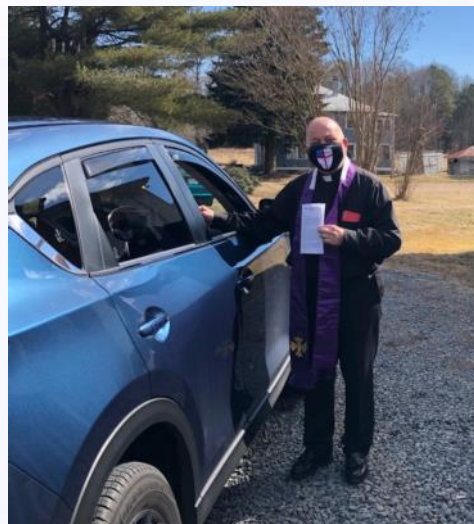
Can I get you some fries with that order?