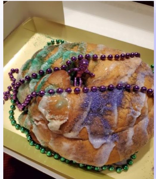
The Topolski Family Feast