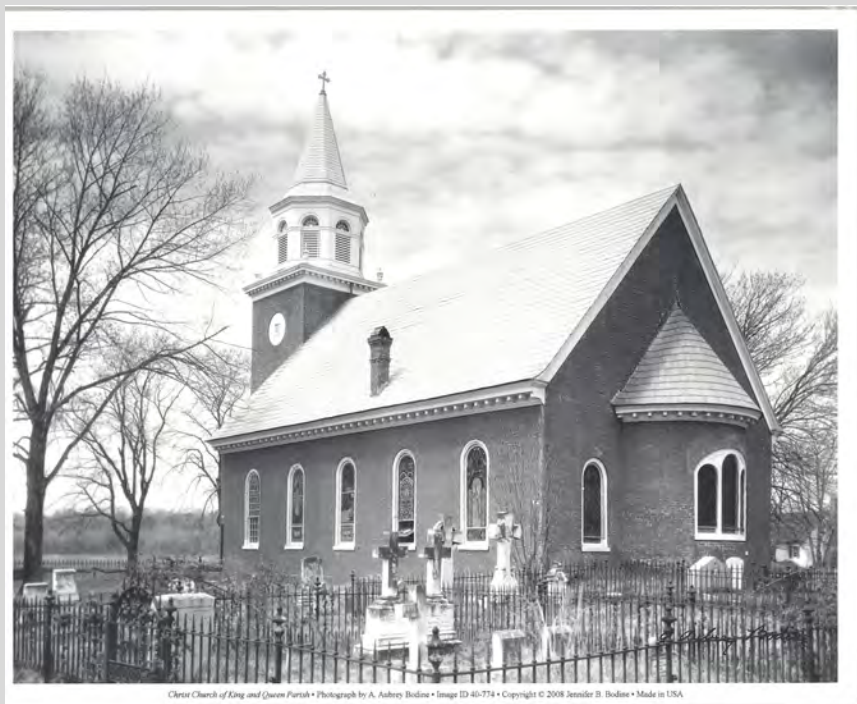
Christ Church of King and Queen Parish • Photograph by A. Aubrey Bodine • Image ID 40-774 • Copyright © 2008 Jennifer B. Bodine • Made in USA

That's all from the Buildings & Grounds Committee for now, anyone interested in participating can reach out to me for info or just come on out to a meeting. For now, Buildings and Grounds Committee is meeting on the first Wednesday of each month at 6:30pm; in September we will move our meetings to the first Tuesday of each month at 6:00pm. Our meetings last for roughly an hour and are more productive with more members!