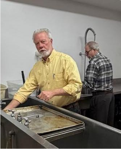
Shrove Tuesday Men's Kitchen